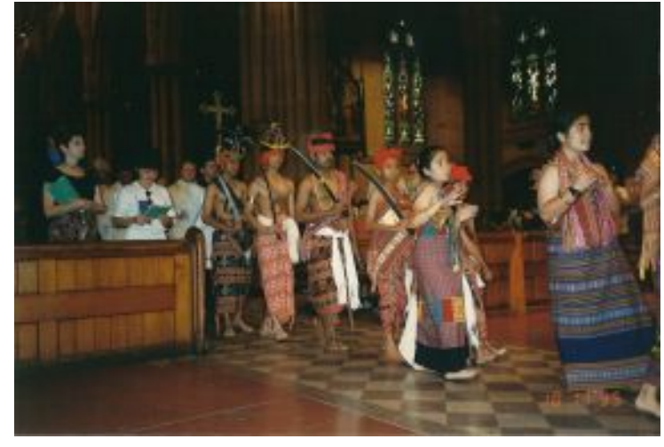
Timorese dancers in St Marys Cathedral November 1995

One Australian observer later spoke of being deeply moved when travelling to a polling place in the early hours of the morning and seeing hundreds of people dressed in their Sunday-best clothes, emerging from a misty valley, all with their voting papers held tightly in their hands.