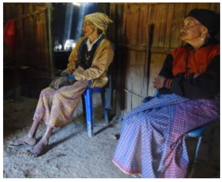
Poverty remains dire in Timor-Leste

ATLAS considers this a very worthwhile project – assisting the aged and disabled while at the same providing education and job creation.